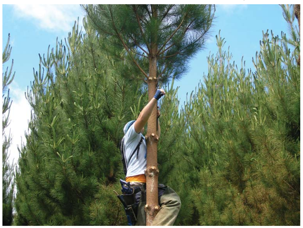
Wayleggo No. 62 1<sup>St</sup> lift pruning

Pest controlis conducted regularly by GFM Staff and Ranginui Hunting. Between us our focus is on keeping goat numbers to a minimum especially in our younger forests. Goats target the bottom portion of the stem stripping the bark and exposing the inside, once exposed the core-wood becomes defective reducing the amount of clearwood