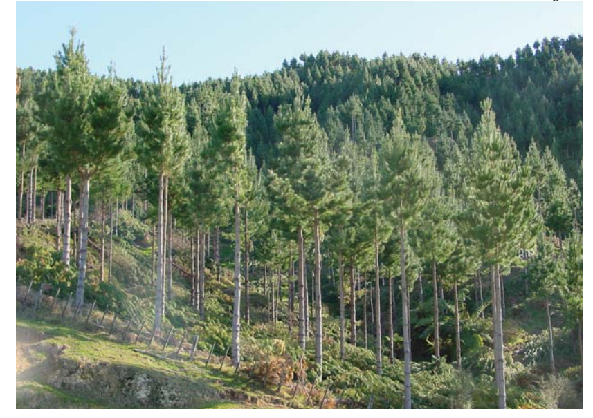
Millennium No. 44 thin to waste

We have since changed our focus to the regulated market (ETS) which has now become law. Over the past couple of months we have researched, analysed and tried to come to grips with the positives and the negatives of the ETS. Continued Page 2