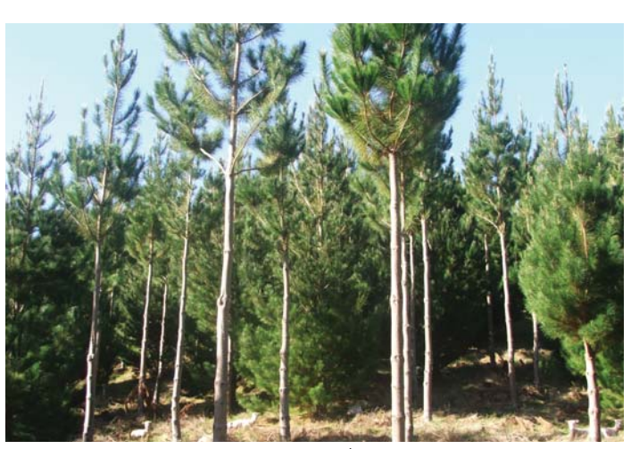
Glen Afton No. 54 2<sup>nd</sup> lift pruning