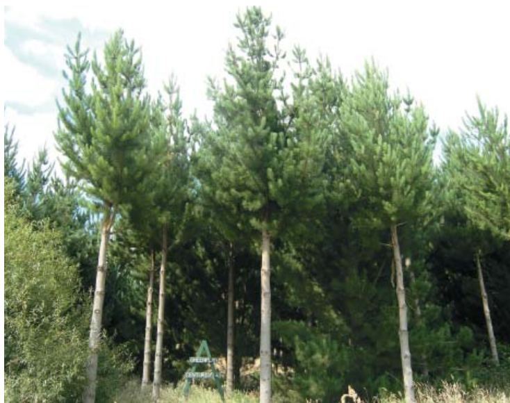
"Centurion Partnership No. 45, Trees due for final prune"