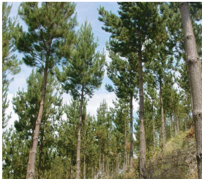
"Cattle Stop Partnership No 35, Quiet Please Trees Growing"

Also on Annual Fees: There are some partners who have annual fees outstanding from previous years, you know who you are!. These fees ensure we get the best service from our Auditors, Forest Manager and Statutory Supervisor. The fee also covers insurances, rates and administration. In fairness to your other partners we ask you to ensure the outstanding fees are paid. We would not like to have to forfeit your unit due to a relatively small debt owing.