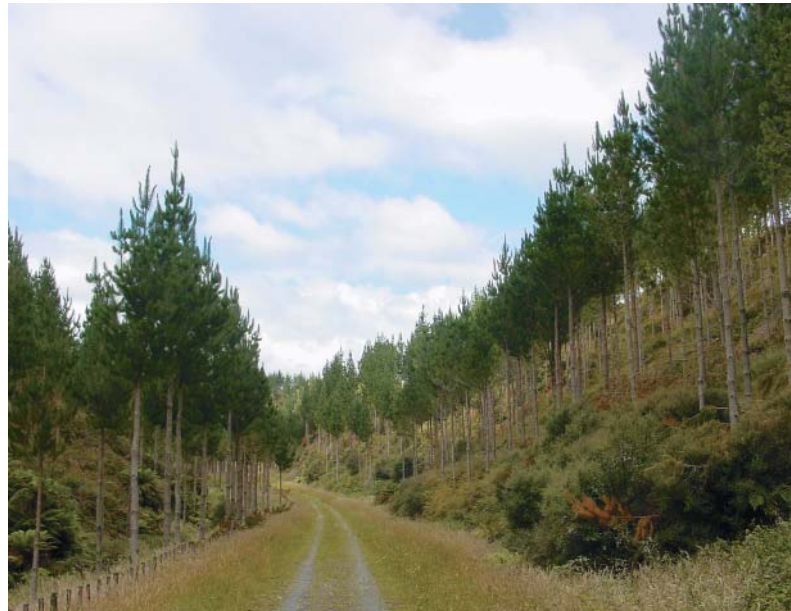
"Squires Creek Partnership No. 38, Left to grow"

So sorry about the Field Day (or lack of it) but you can come and see your forest anytime. Next summer we will try harder.